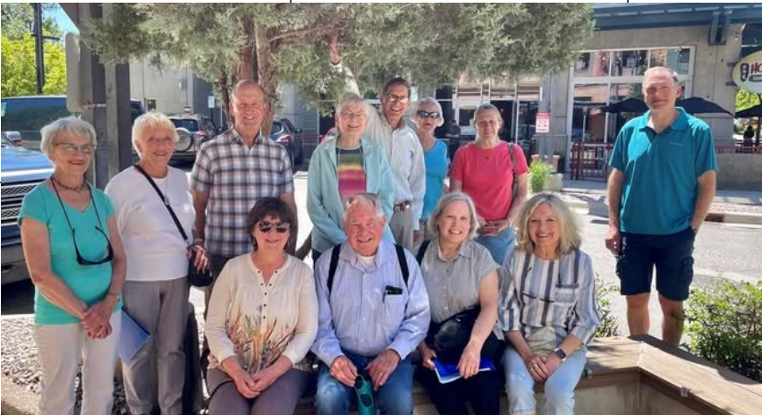
Members of Faith and Justice in Action